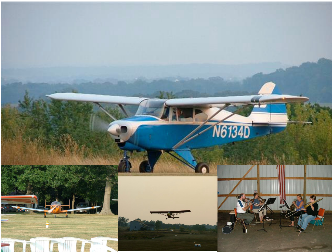
Photos from past Sugar Ridge Fly-In