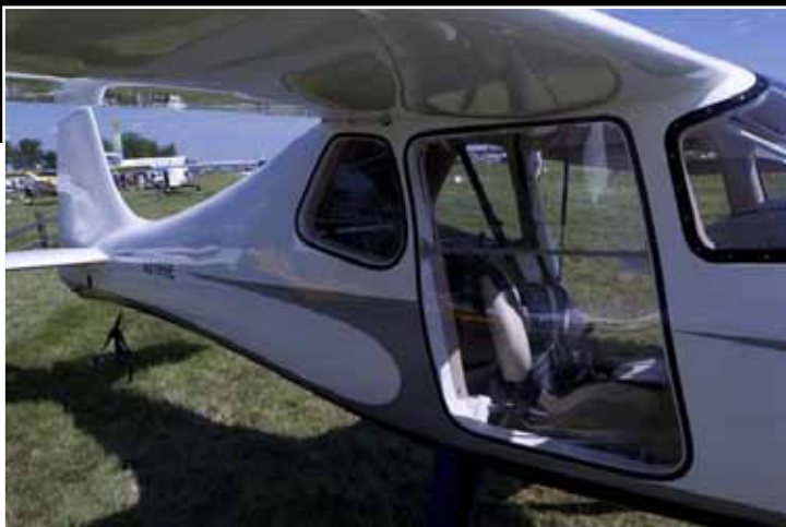
Clockwise from above: The award-winning homebuilt Savor's glass doors make for an incredible view.