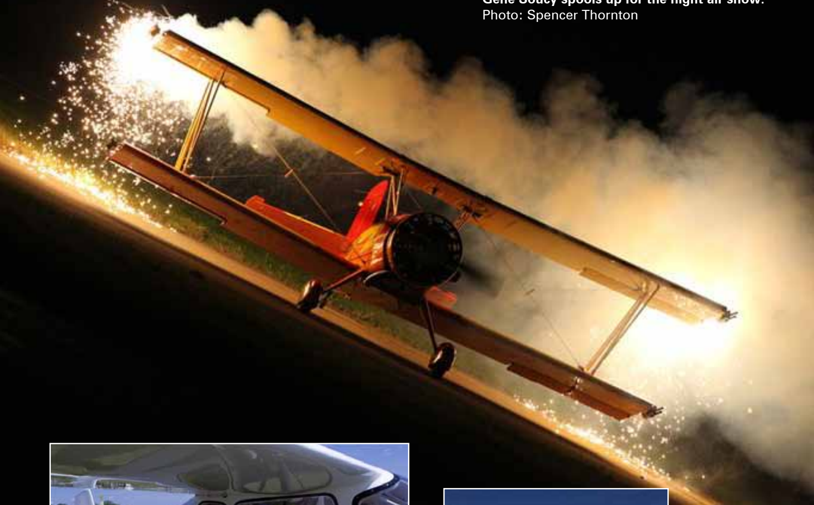
Gene Soucy spools up for the night air show.