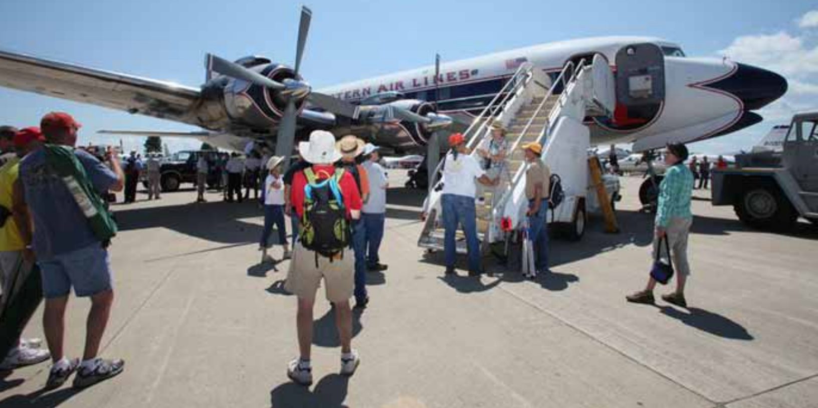
The last flying DC-7 on display at EAA AirVenture Oshkosh 2010.