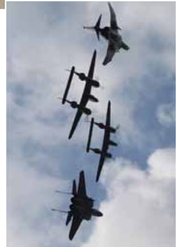
Heritage Flight: two P-38 Lightnings, an F-4 Phantom, and an F-15 Eagle.