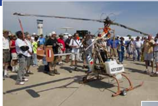
Clockwise from upper left: A super-rare DC-2 is on display at AeroShell square.