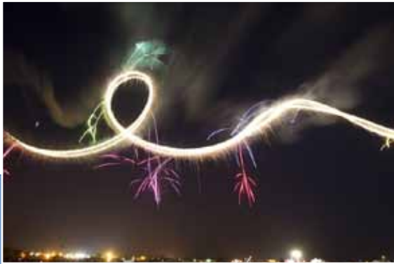
The Jet Glider's trails in the night sky.