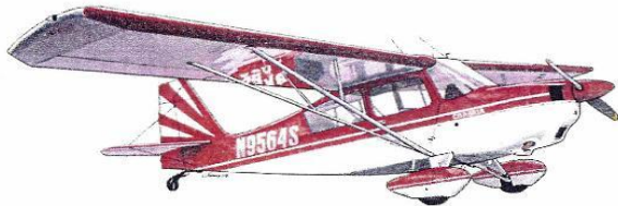
Aircraft: 1965 Citabria "N9564S"