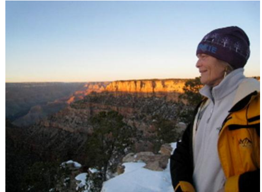
Yes, we did hike in snow and 85 degree heat.....hmm.