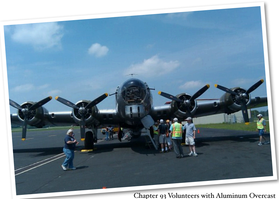
Chapter 93 Volunteers with Aluminum Overcast

I think it was when the Operation Thirst volunteer came by that it hit me. As we