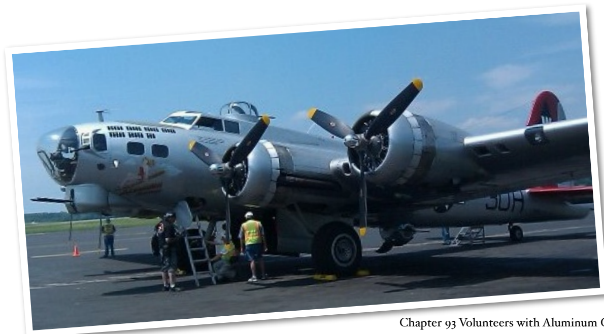
Chapter 93 Volunteers with Aluminum Overcast

activity happening all around us. EAA volunteers just like us are the fuel for much of this activity. It felt rewarding to contribute effort that will help bring such a fabulous event to fruition.