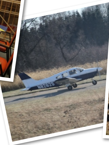
Below: A Cherokee takes off.