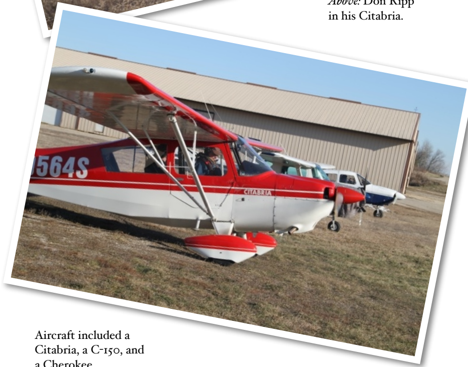
Aircraft included a Citabria, a C-150, and a Cherokee.

It was a very cold day. At 11 AM, the temperature was 8 degrees, wind 6 mph and visibility 10 miles. We had three brave souls fly in, and the rest drove cars with heaters.