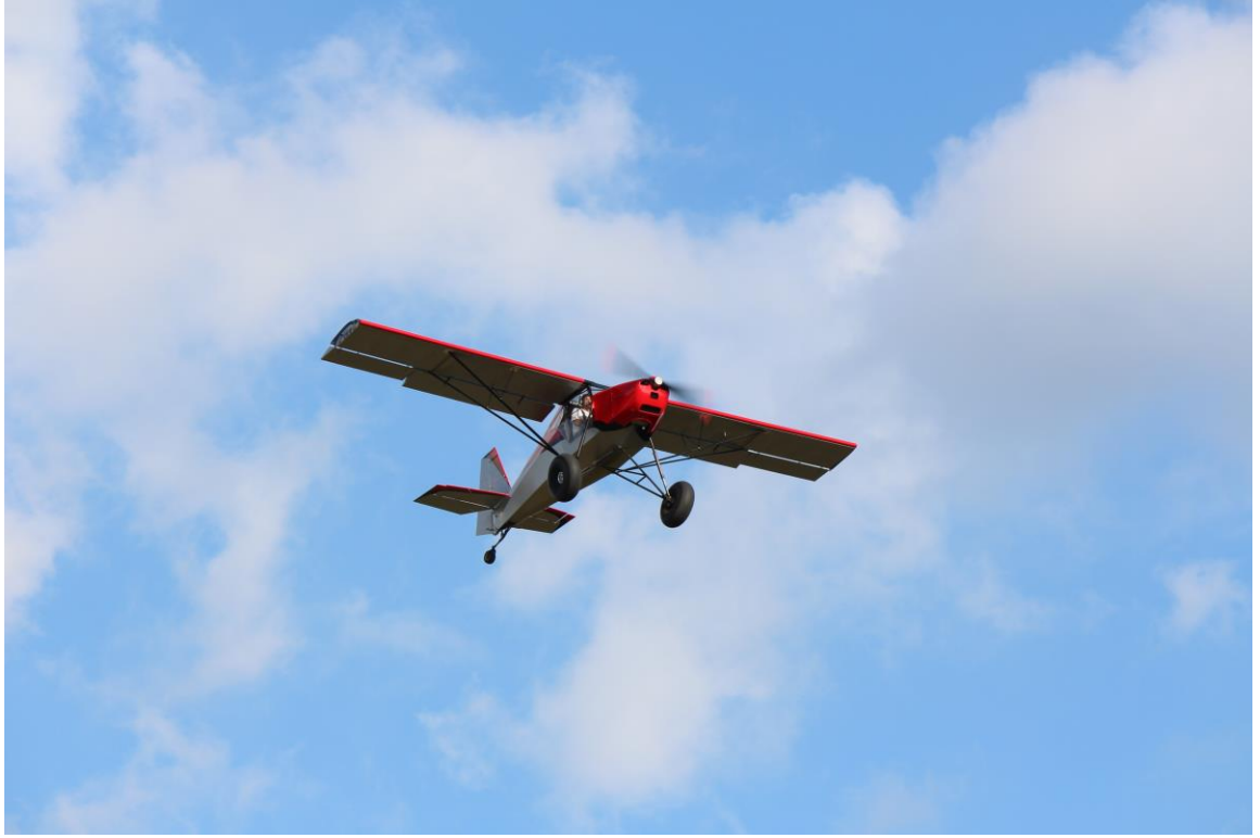
Hope to see you there!