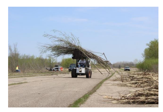
Spring cleanup at Blackhawk