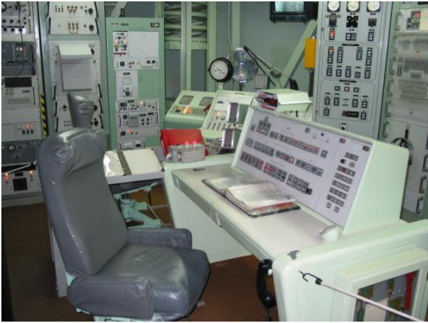
Titan II missile in its silo and launch controls (above). Computers and blast door (below).