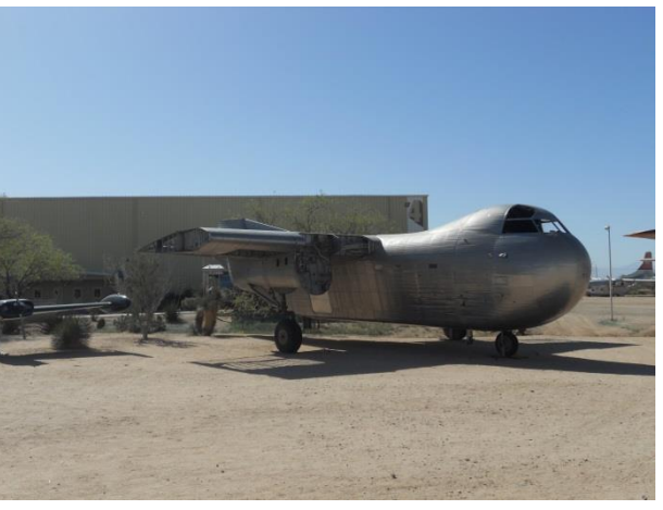
Ryan Firebee target drone and Budd Conestoga (above). Boeing YC-14 STOL tactical transport (below).