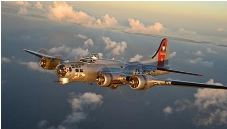
Photograph of B-17

Greetings Chapter 93 members from the planning desk of HBW 2015! We are just 2 months away from the 2015 event and it is shaping up to be a dandy once again. Our participating aircraft are listed on the website at www.heavybombersweekend.splashthat.com , and there are a few aircraft that are still in the works, yet to be announced. Watch for those updates on the website, and social media pages www.facebook.com/madisonHBW in the weeks to come.