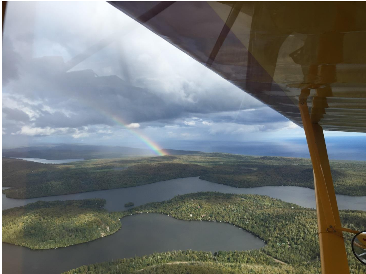
Chasin' Rainbows near Grand Marais, Minnesota