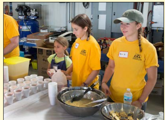
Young volunteers at Pancake Breakfast