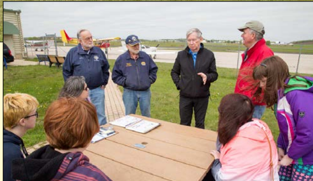
Clark Street Charter School