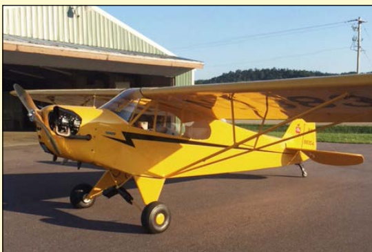
Dan Uminski's Grand Champion Cub