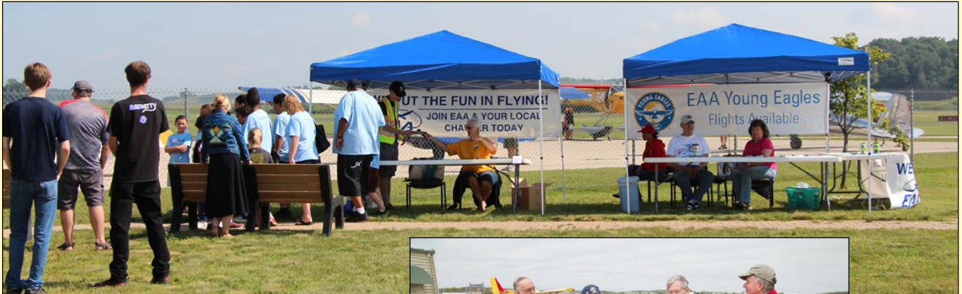
Registration tables at Young Eagles