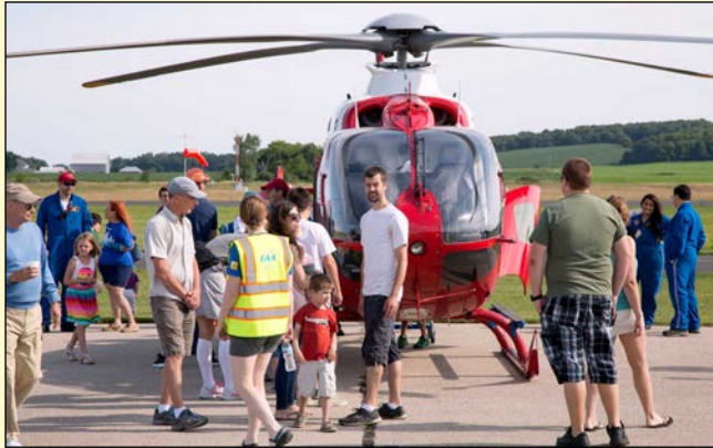
Med Flight helicopter at Pancake Breakfast