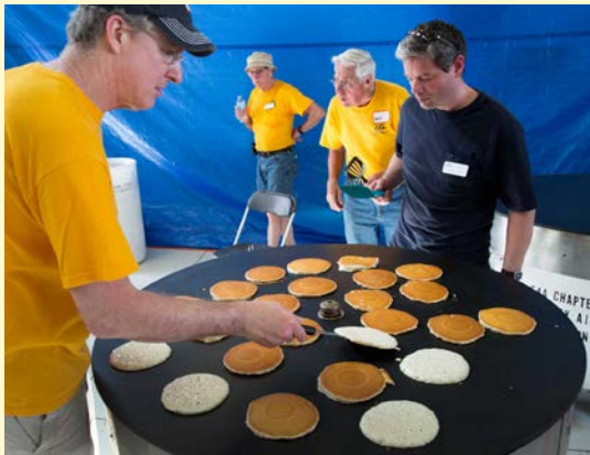
Pancake Breakfast, flipping pancakes

July, 2017. The Annual Pancake Breakfast at Morey Field was a huge success. We served over 1,200 breakfasts. Thanks to all of the volunteers who cooked, cleaned, set up/tore down, parked aircraft, or did other various and sundry tasks.