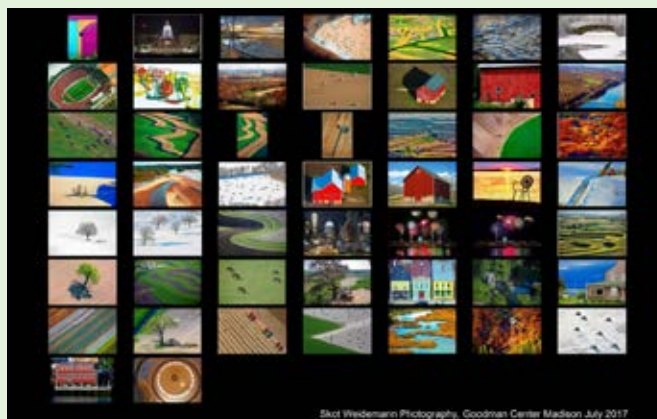
Proof sheet showing examples of Skot's photography

Diane Endres Ballweg Gallery Goodman Community Center 149 Waubesa Street