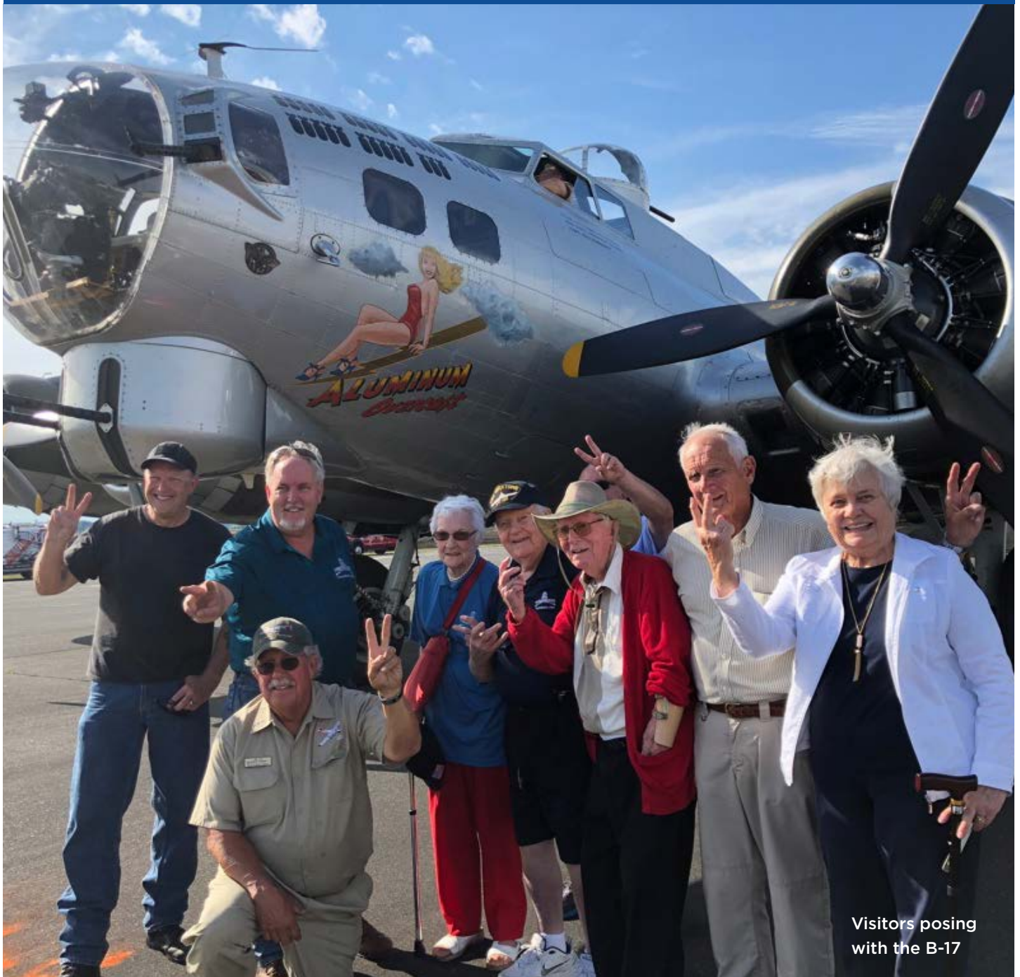
Visitors posing with the B-17